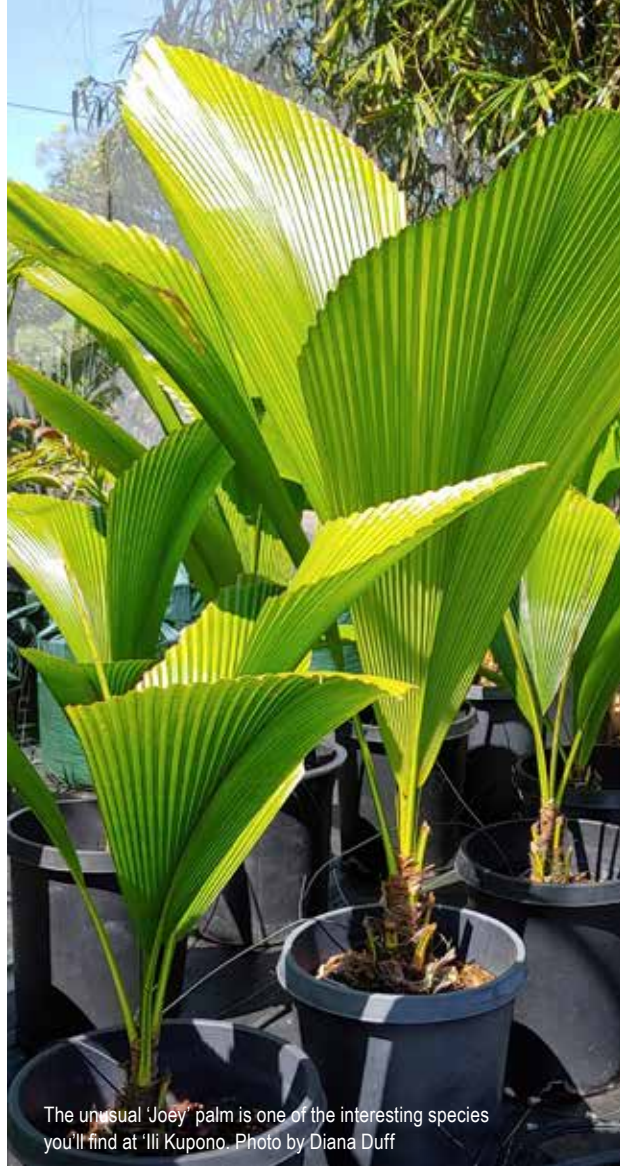
The unusual 'Joey' palm is one of the interesting species you'll find at 'Ili Kupono.