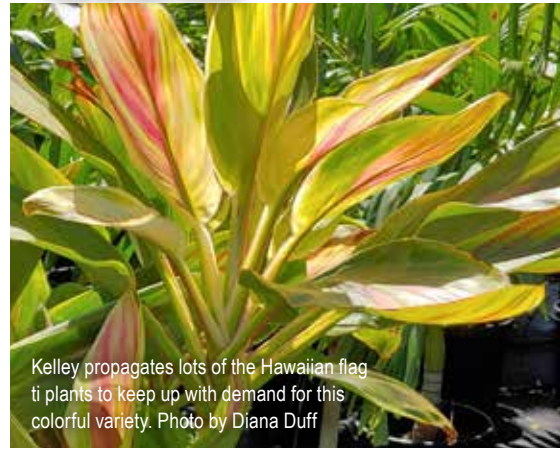
Kelley propagates lots of the Hawaiian flag ti plants to keep up with demand for this colorful variety.