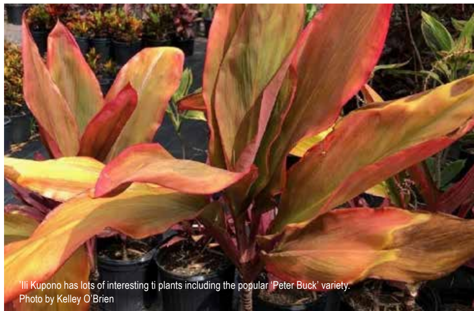
'Ili Kupono has lots of interesting ti plants including the popular 'Peter Buck' variety.