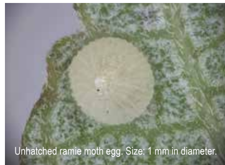
Unhatched ramie moth egg. Size: 1 mm in diameter.

The ramie moth is a large brown moth native to Southeast Asia with the potential to inflict substantial damage through its leaf feeding on mānaki and other native nettles. Currently, ramie moths have been spotted feeding in both wild and cultivated populations of mānaki on Maui and Hawai'i Island. The biggest impact of the ramie moth on plant health is during its larval stage. Caterpillars hatch from eggs that are clear-white, circular, and laid singly on the underside of leaves. There are usually one to two eggs per leaf scattered throughout the plant.