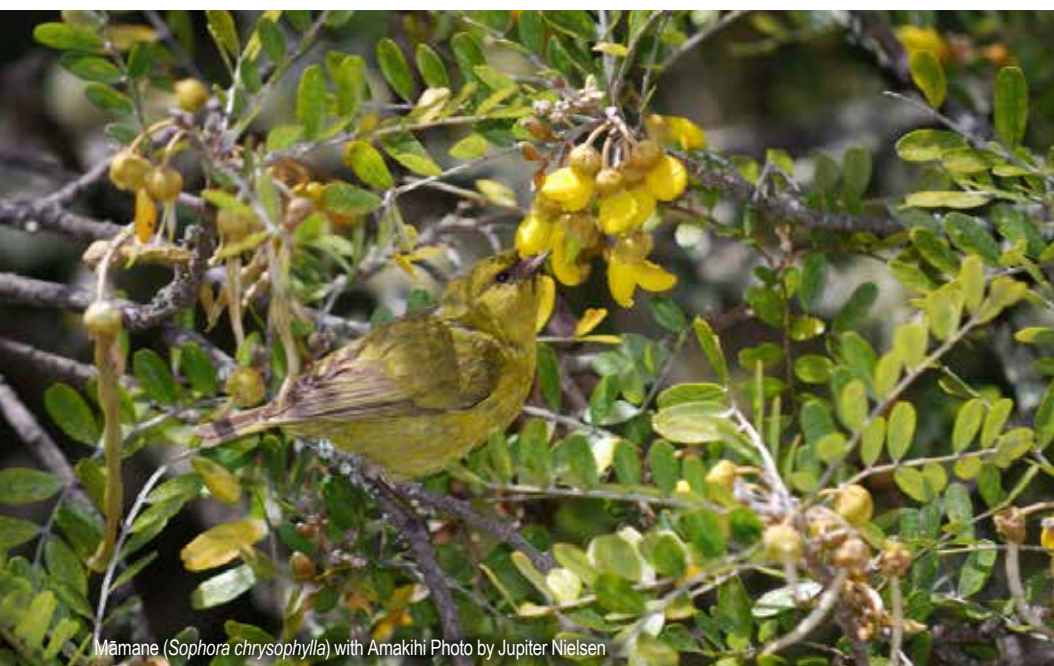
Māmane ( Sophora chrysophylla) with Amakihi

is a Big Island coastal variety with a dwarf habit that is sold as “naio papa” or groundcover naio, which maxes out at several feet tall despite the name and shares all other qualities.