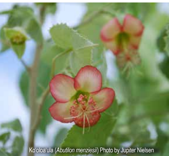
Ko'oloa'ula ( Abutilon menziesii)