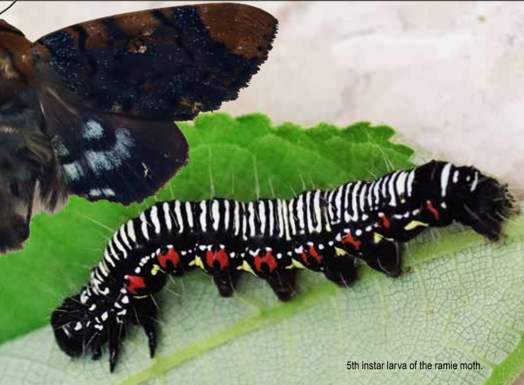
5th instar larva of the ramie moth.