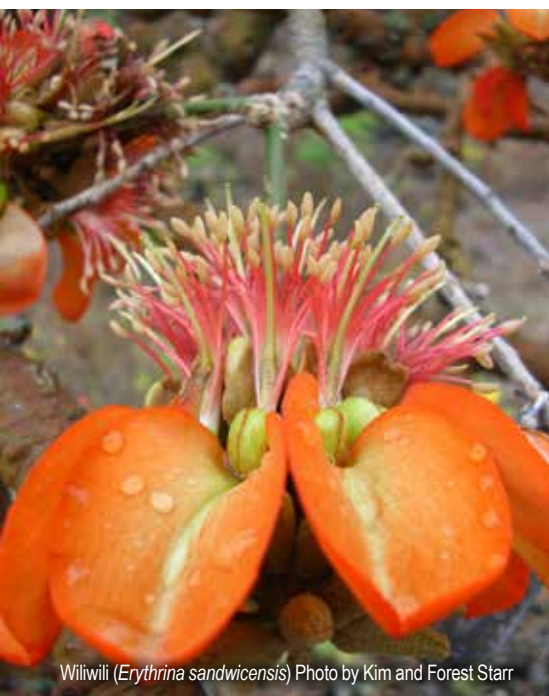
Wiliwili ( Erythrina sandwicensis )