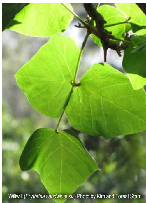
Wiliwili ( Erythrina sandwicensis )