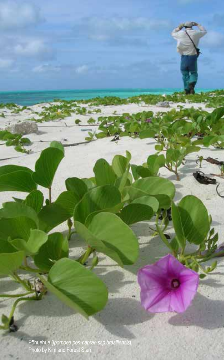
Pōhuehue ( Ipomoea pes-caprae ssp. brasiliensis )