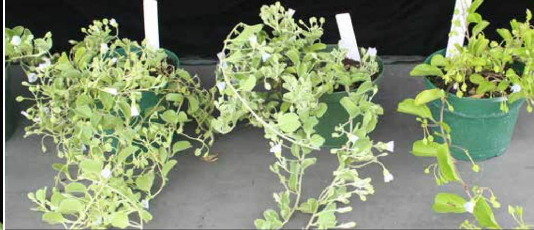
Wild-collected and cultivated pā'ūohi'iaka grown under the same conditions show varying degrees of hairiness, growth and flower color