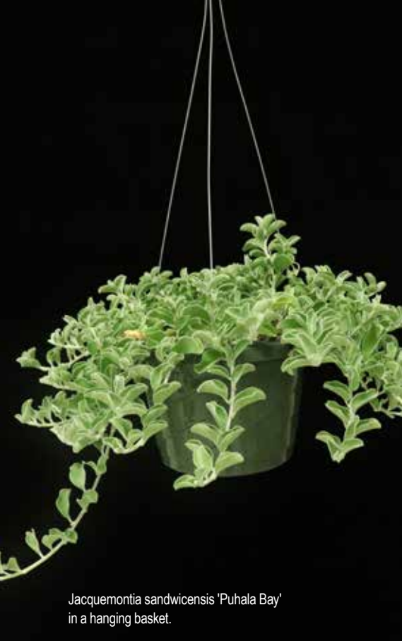
Jacquemontia sandwicensis 'Puhala Bay' in a hanging basket.