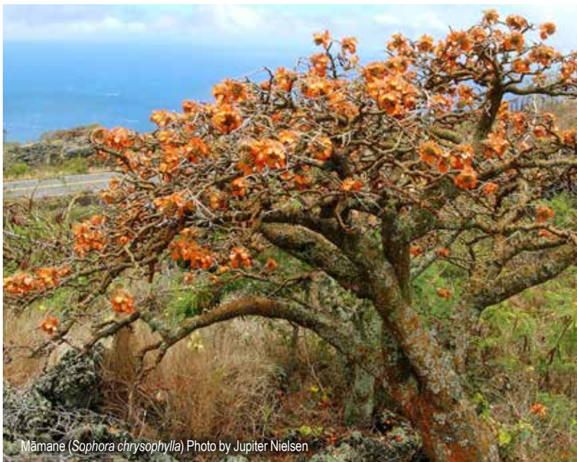
Mamane ( Sophora chrysophylla)