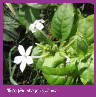
'Ili'e ( Plumbago zeylanica )