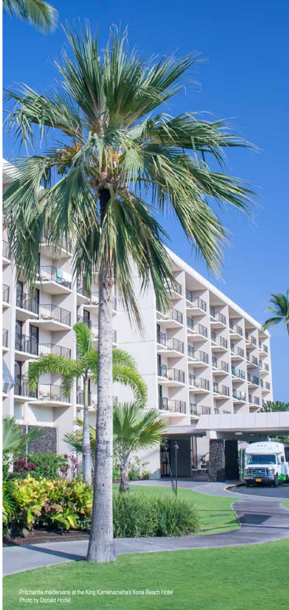
Pritchardia maideniana at the King Kamehameha's Kona Beach Hotel

Root initiation zone: area of the trunk, typically at the base or proximally, where roots initiate.