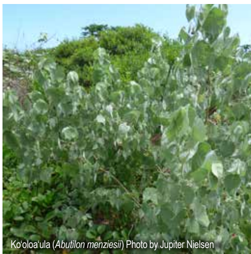
Ko'oloa'ula ( Abutilon menziesii)