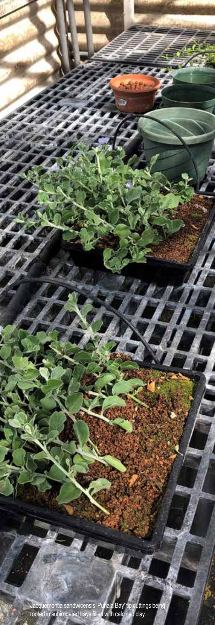
Jacquemontia sandwicensis 'Puhala Bay' tip cuttings being rooted in subirrigated trays filled with calcined clay.