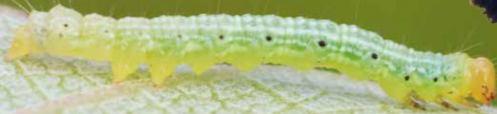
1st instar larva of the ramie moth.

H awai'i is the most isolated landmass globally, which resulted in an extensive diversification of unique plants and animals on the islands. Sadly, Hawai'i is also the "invasive species capital" of the world. The rise of human transportation worldwide accelerates the movement of species from their native geographical ranges to new regions like Hawai'i. These invasive species can cause dramatic shifts in ecosystems as many of these species become invasive and result in negative ecological and economic consequences.