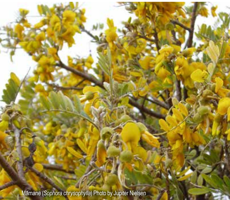
Mamane ( Sophora chrysophylla)