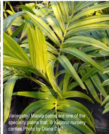
Variegated Manila palms are one of the specialty palms that 'Ili Kupono nursery carries.