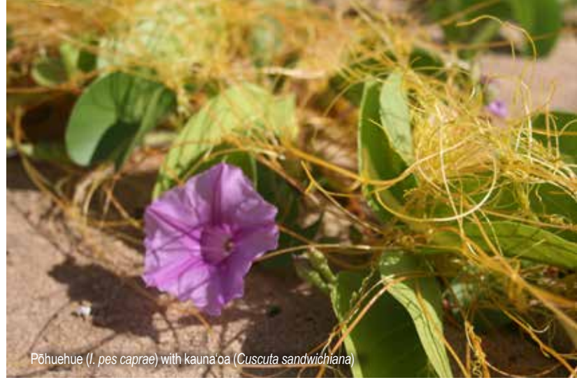
Pōhuehue ( I. pes caprae ) with kauna'oa ( Cuscuta sandwichiana )