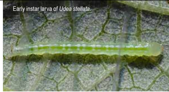
Early instar larva of Udea stellata .