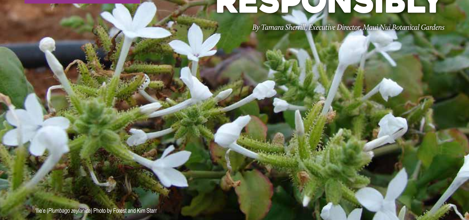
'Ili'e ( Plumbago zeylanica )

Many people who have landscaped with native Hawaiian plants conclude that they have awfully specific needs. The plant you thought would be perfect declines from a nearly invisible scale insect or being planted just outside its comfort zone. Hawai'i's endemic plants evolved in a geography with widely variable soils, moisture regimes, and temperatures, and many less pressures from pests and diseases. Some are generalists adapted to many elevations, and others only like certain conditions.