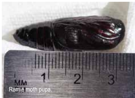
Ramie moth pupa.

They have a dark brown head, and dark brown forewings with black markings, speckles of silvery-blue, and scalloped wing edges. Hindwings have bright silvery-bluish markings. Adults have a short lifespan, living no more than a week and may feed on tree sap or rotting/overripe fruit. Populations of the ramie moth seem to increase during the spring from March to May before decreasing in the winter.