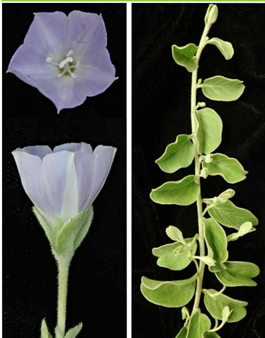
Close-up photos of the flowers and foliage of Jacquemontia sandwicensis 'Puhala Bay'.

*missing photos as well* - Puhala Bay as a groundcover.jpg