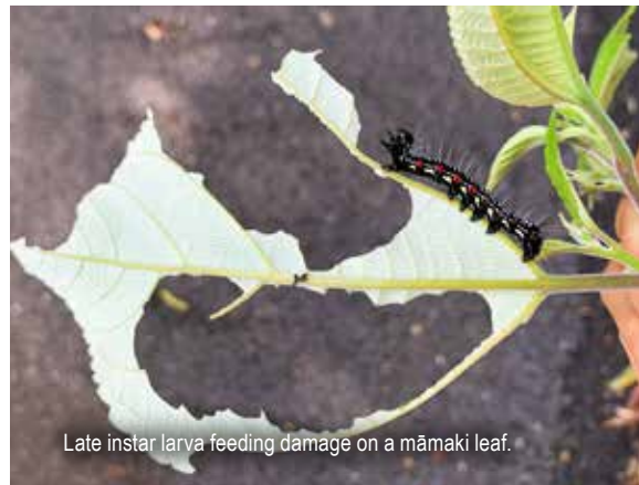
Late instar larva feeding damage on a mānaki leaf.