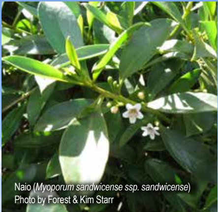
Naio ( Myoporum sandwicense ssp. sandwicense )