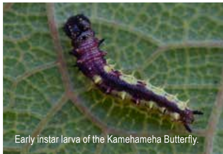
Early instar larva of the Kamehameha Butterfly.

They have a dark brown head, and dark brown forewings with black markings, speckles of silvery-blue, and scalloped wing edges. Hindwings have bright silvery-bluish markings. Adults have a short lifespan, living no more than a week and may feed on tree sap or rotting/overripe fruit. Populations of the ramie moth seem to increase during the spring from March to May before decreasing in the winter.