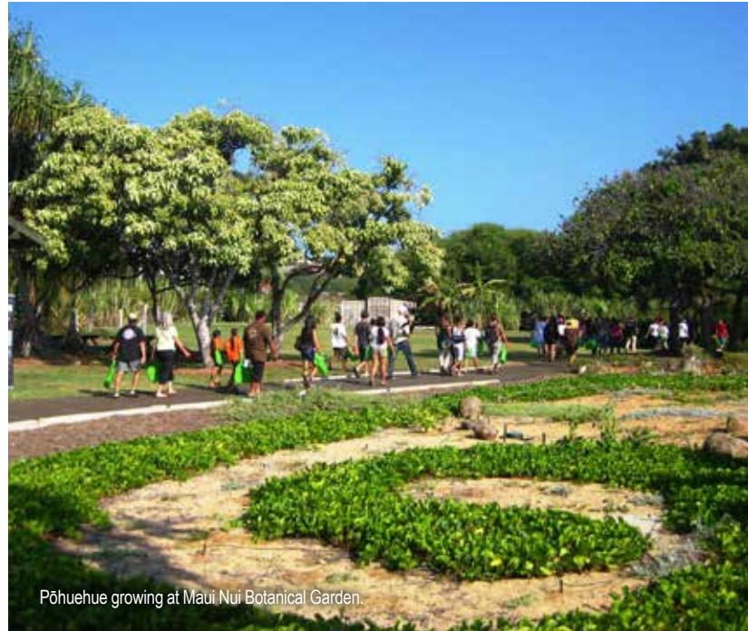
Pōhuehue growing at Maui Nui Botanical Garden.

native Hawaiian species that live both as ground dwellers and as epiphytes on trees. P. leptostachya therefore thrives in filtered light or partial sun, and still looks fresh in a drought. It is a perfect first native plant to give a friend in a small pot, as it does not mind root crowding.