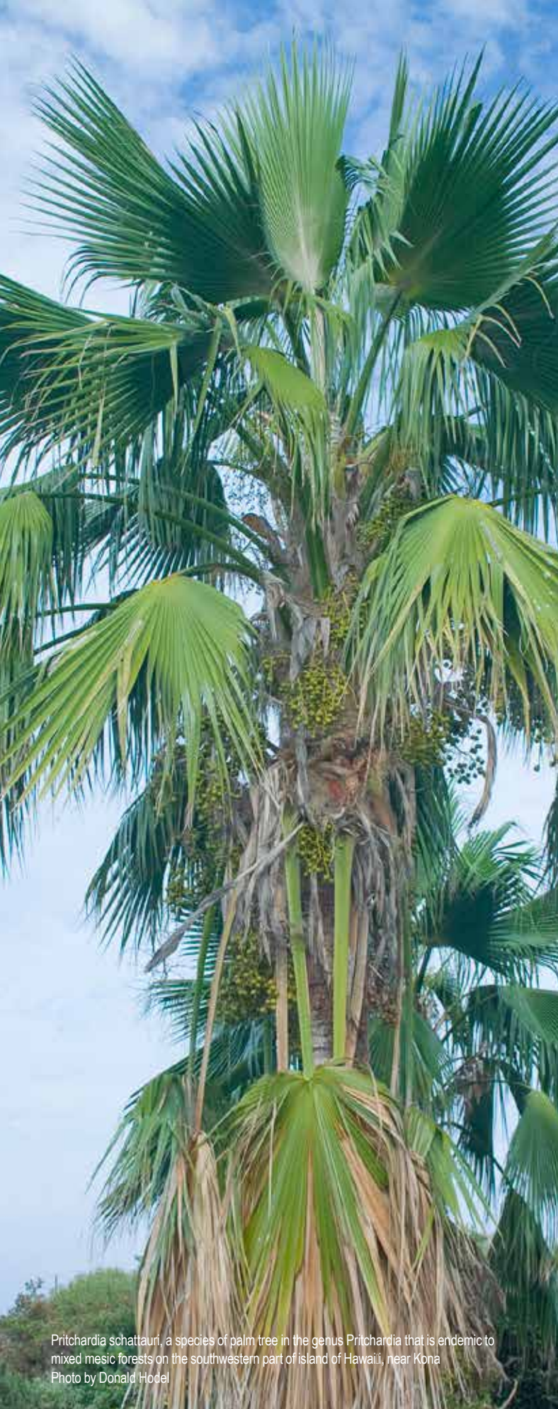
Pritchardia schattauri , a species of palm tree in the genus Pritchardia that is endemic to mixed mesic forests on the southwestern part of island of Hawaii, near Kona